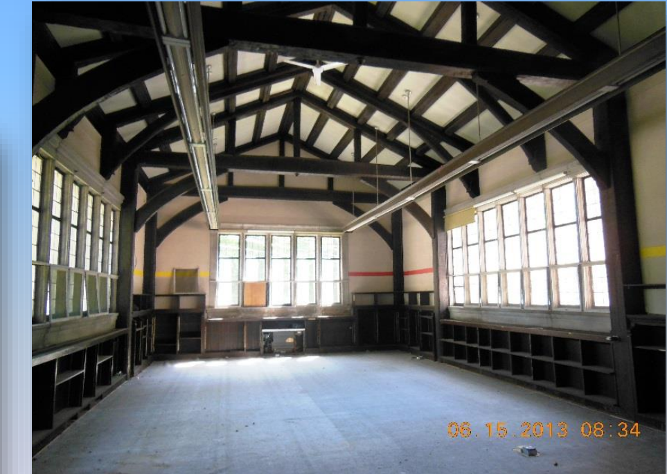
Waiting area and small bar in the front, Art gallery in the rear

Lower level for commercial space and restaurant support