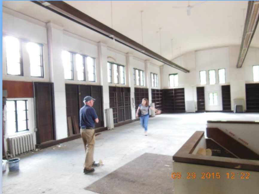
Space for the restaurant

The restaurant in the main floor, with art gallery space in the reading room, commercial space in the lower level