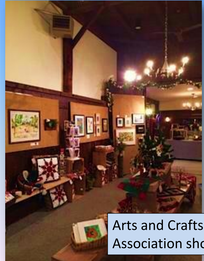
Arts and Crafts Association show