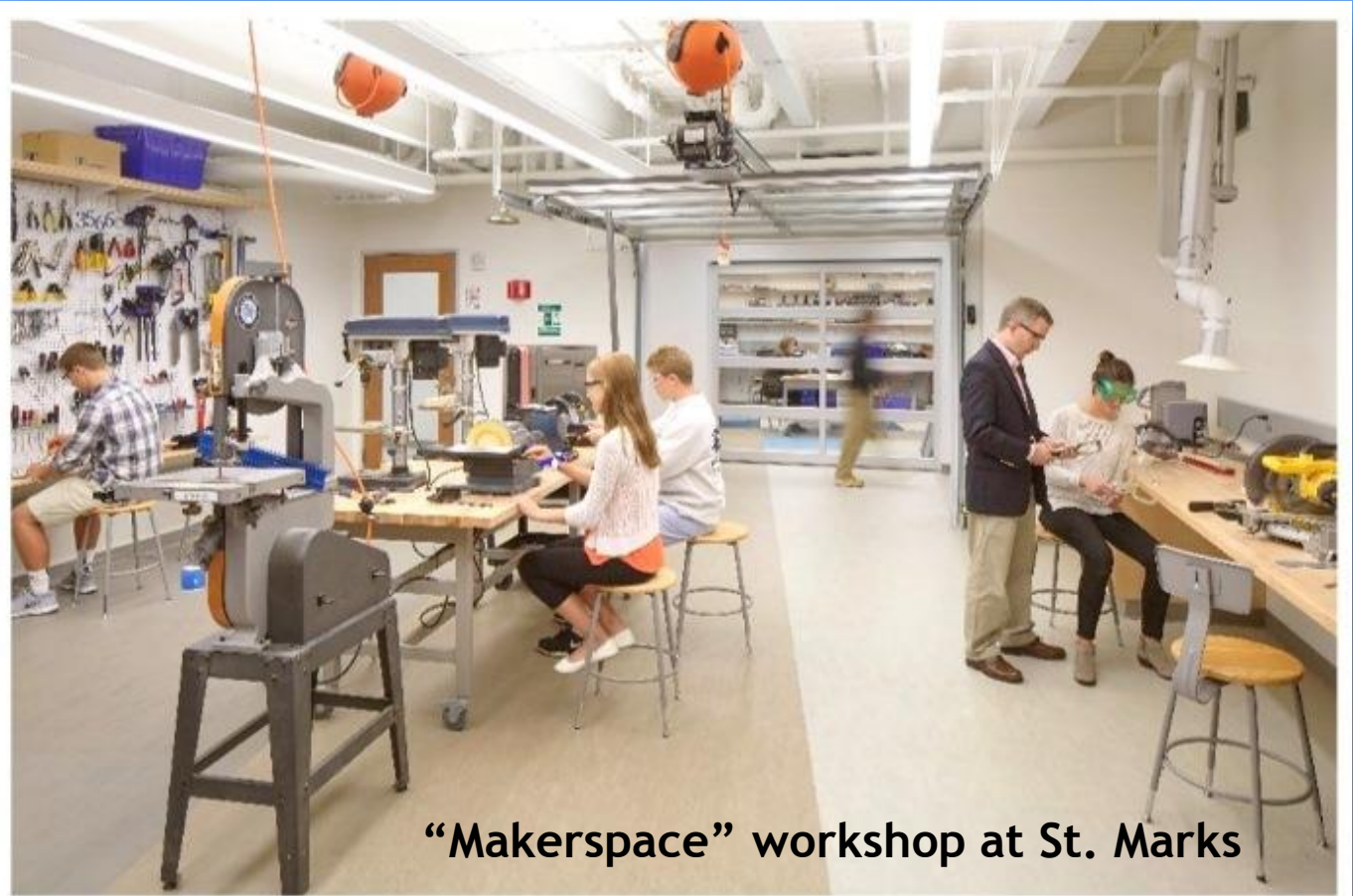
“Makerspace” workshop at St. Marks

We do agree the WAIC and “Makerspace” concept has value for the Town